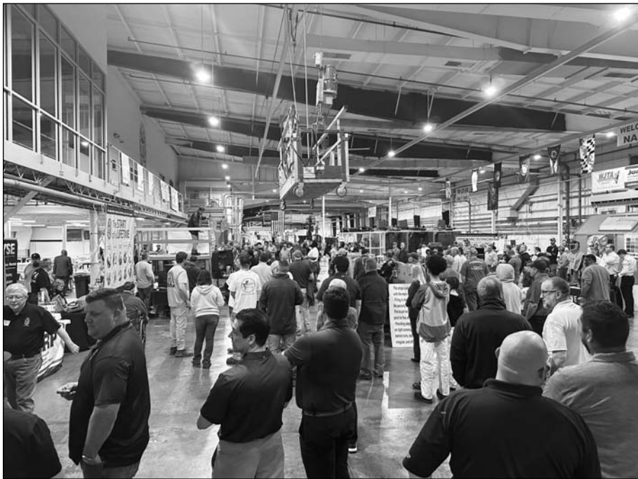
Attendees of the 2024 Coating and Corrosion Expo visit vendor exhibits during the event at the Painters DC 53 Training Center in Weston, West Virginia.