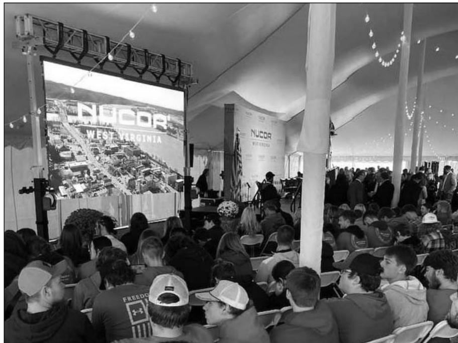
Nucor Steel holds a groundbreaking ceremony on October 20, celebrating the commencement of construction on a $3.1 billion sheet steel facility located in Mason County, West Virginia.

pleted by our skilled tradesmen and women on their new facility in Mason County." ■