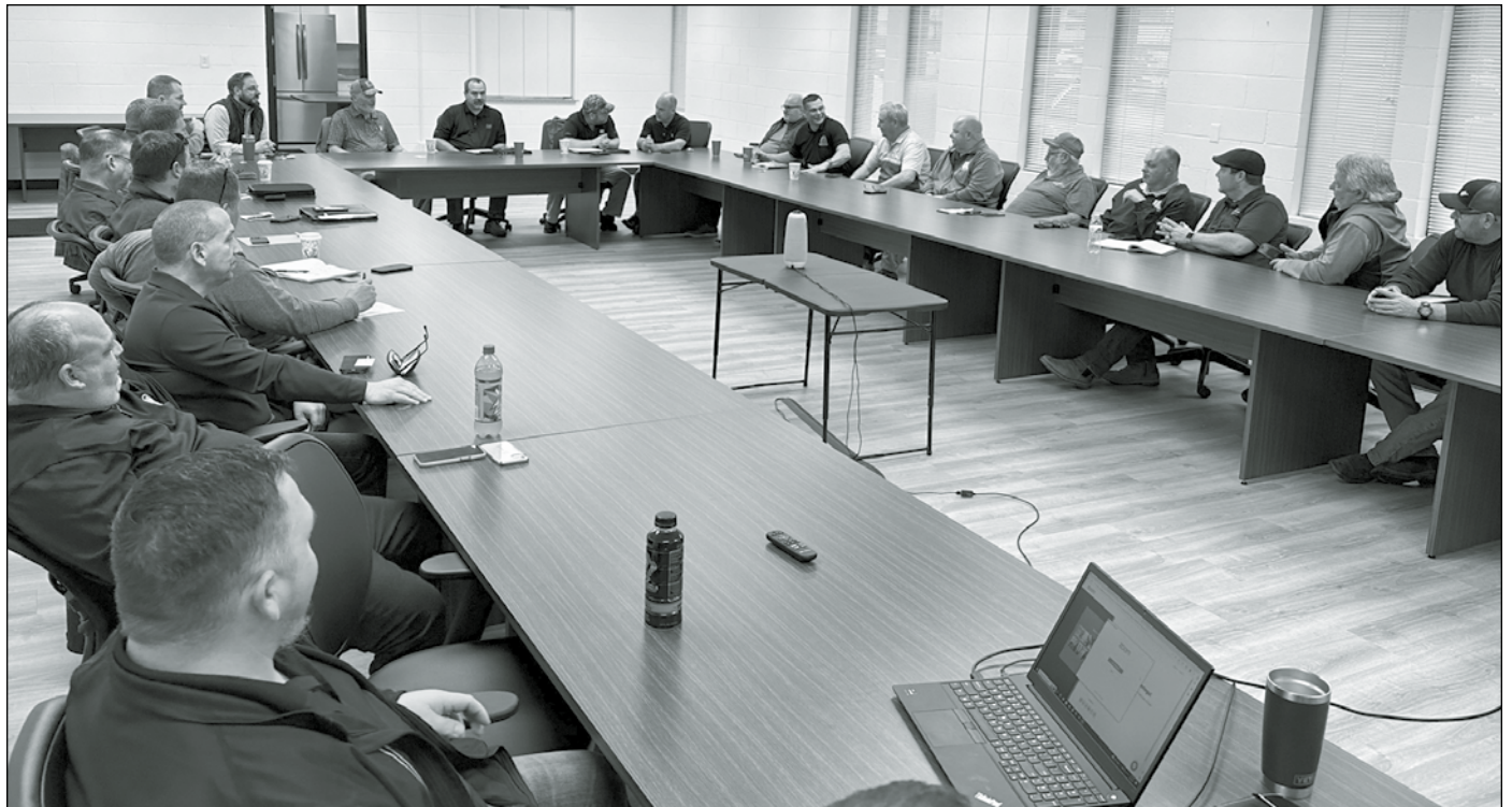
Representatives from Nitro Construction Services meet with West Virginia State Building and Construction Trades leaders, at the Building Trades headquarters in Charleston, about upcoming work at the Nucor Steel project in Mason County, West Virginia.