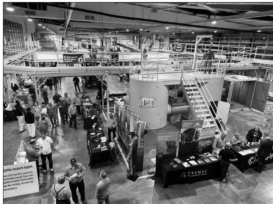
Attendees of the 2023 Coating and Corrosion Expo visit vendor exhibits during the event at the Painters DC 53 Training Center in Weston, West Virginia.

The tour is part of an ongoing effort by ACT and the Trades to educate the general public about the benefits of craft apprenticeship programs.