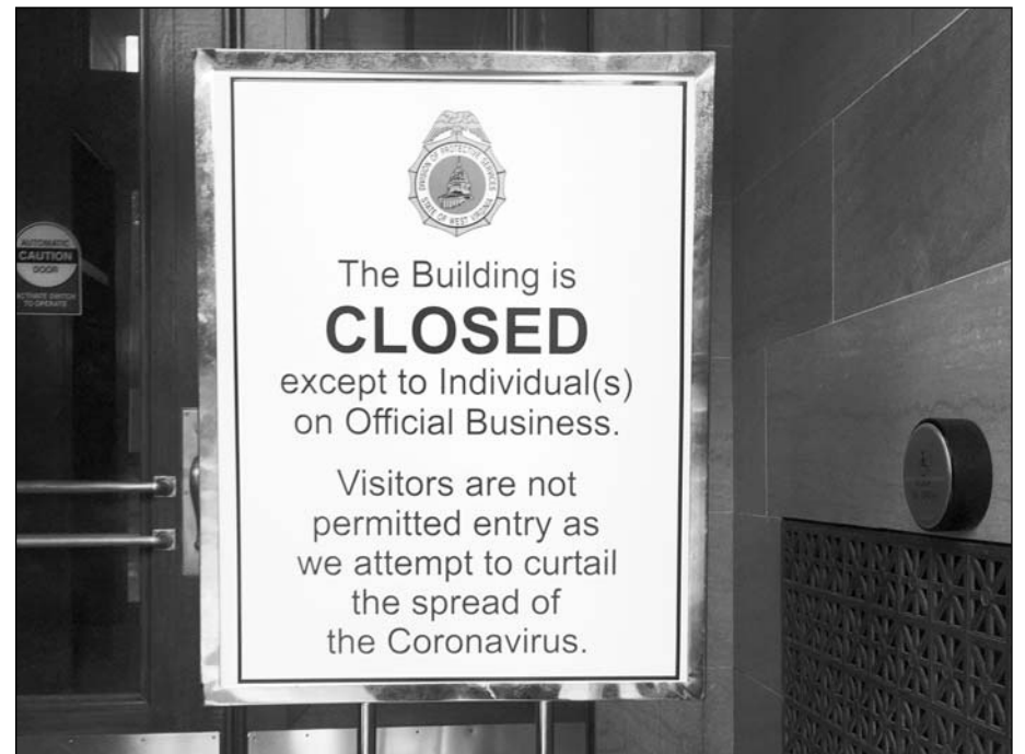
Citizen access to the Capitol has been almost entirely shut down. At the same time the pace of legislation has been increased dramatically meaning limited public input only can be made through mail, email and phone calls.