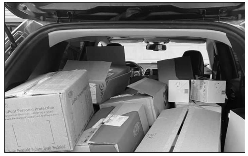
Insulators Local 2 based in Pittsburgh donated a load of Personal Protective Equipment. Local 2 covers the northern part of WV.

Reports from various parts of the state show Insulators, Boilermakers, Carpenters, and Pipefitters have all done the same. ■