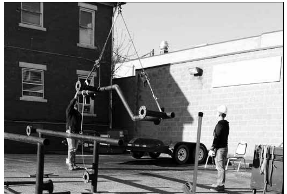
Apprentice contestants take a rigging test as part of the apprenticeship contest held in Huntington April 3 - 6. Five pipe trades locals in WV; Charleston #625, Parkersburg #565, Morgantown #152, Wheeling #83 and Huntington #521 participated.