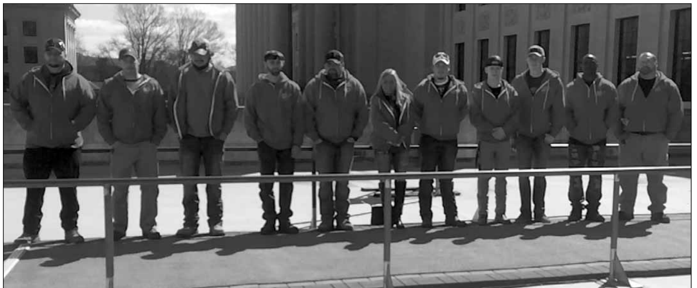
These Operating Engineers Local 132 members were among the many craft workers who came to the state Capitol in Charleston to support jobs during the regular session of the legislature.

As the ACT Report goes to press the Special Session is underway. ■