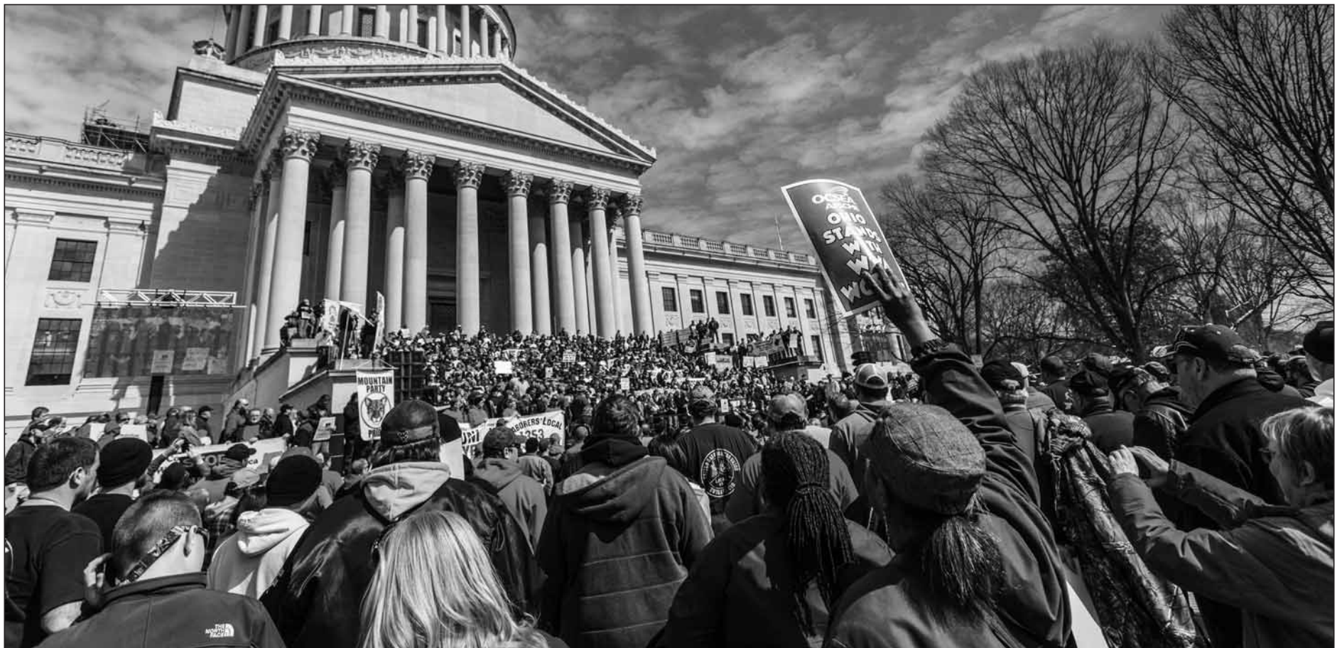
According to WV State Police an estimated 7,000 people attended a labor rally in Charleston on March 7 to protest the direction taken during the legislative session under the new Republican majority.

Non-Profit Org. U.S. Postage PAID Permit # 1374 Charleston, WV 25301