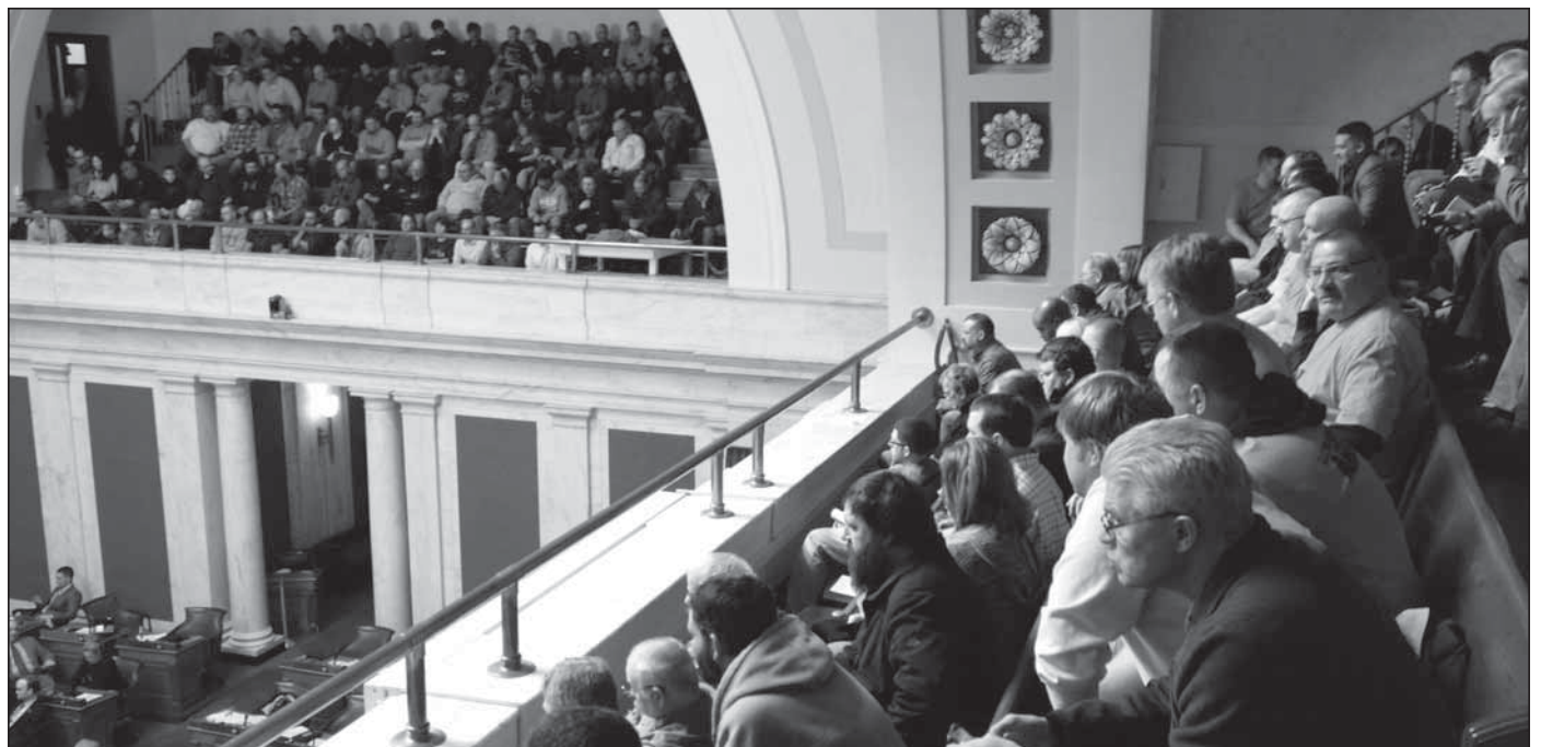
Members of the Trades filled the galleries of the House Chamber on February 28 while debate takes place on the floor over passage of SB 361, just like they did for meetings and hearings throughout the legislative session.