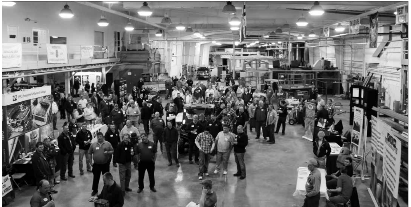
More than 300 people attended the third annual Coatings and Corrosion Expo sponsored by Painters District Council 53 at their Weston training facility in early April.

Business Manager, Painters District Council 53