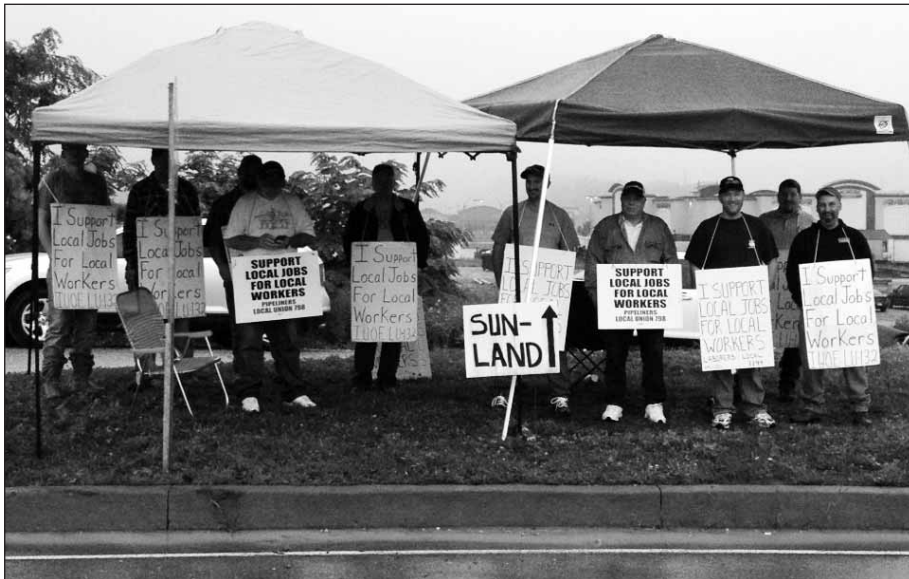
Operators and Laborers want the public to know Sunland Construction is not using local workers on their 14 mile pipeline project. The protest is taking place in Wheeling at the company's yard near the Highlands. Representatives from the Teamsters and Pipeline Welders have also supported the protest.

"We protest to let the public know what is going on but at the same time we get the job done on our projects to show using union labor makes good business sense." ■