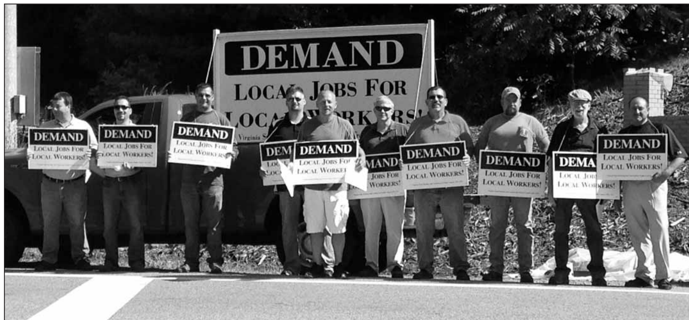
Craft representatives from numerous trades showed up at the Beckley VA in late August to protest millions in construction contracts going to New Jersey based Seawolf Construction and their numerous out-of-state contracts.

Rebich wonders if Seawolf and their out-of-state subcontractors are