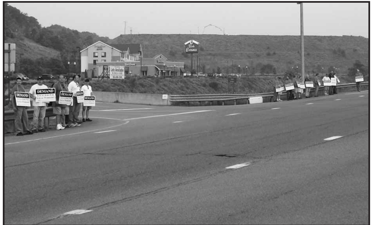
PROTESTING LOST CONSTRUCTION jobs at the Amazon.com project in Huntington were around 40 local workers from a variety of crafts. The action took place on Friday, June 10 and continued the following week.

protest was set to continue every day, “for at least the next week.”