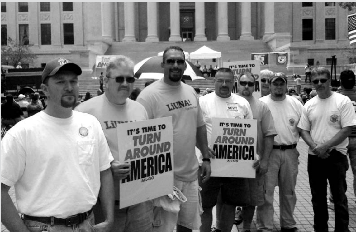
MEMBERS OF THE West Virginia Laborers District Council were among 1,000 participants in the West Virginia AFL-CIO's Turn Around America Rally. The event, held in Charleston on August 2, focused on workers' rights and health care reform.