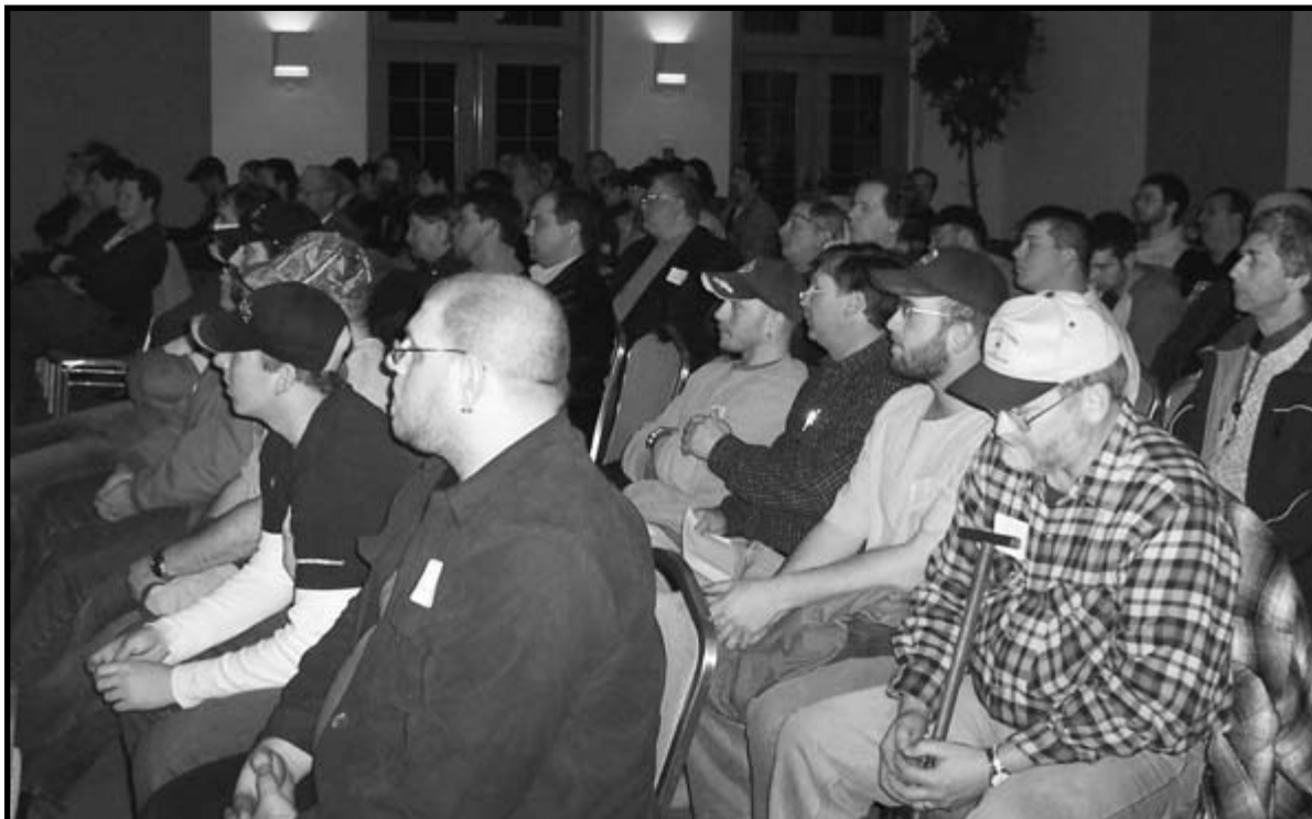
MEMBERS OF THE North Central West Virginia Building Trades turned out again to support the Longview Power project in Monongalia County. The Public Service Commission hearing is hopefully the last public hearing the project will face.