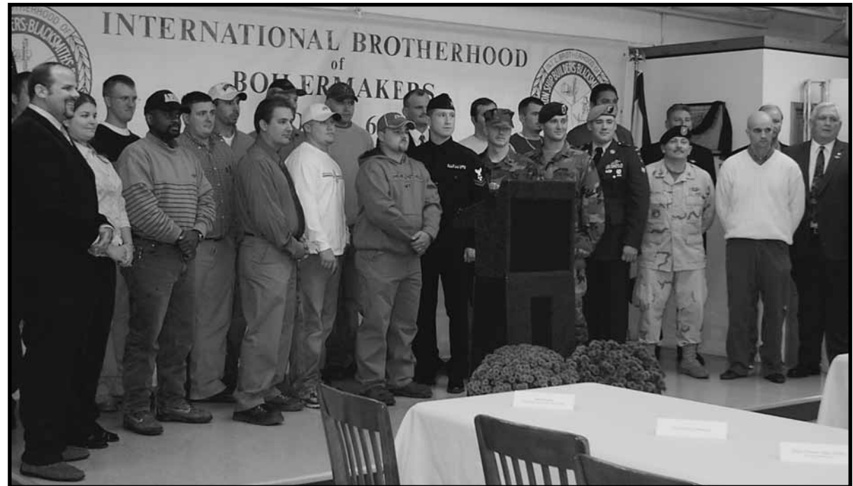
ALL 21 NEW HELMET-TO-HARDHAT Boiler maker apprentices were on hand for the ceremony held at Local 667's headquarters.