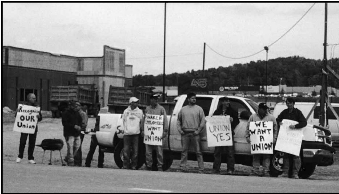
MONARCH WORKERS ARE joined by local union members in support of a union contract. The picket is in front of the Logan's Roadhouse restaurant being built in Beckley.

"There are basic issues about fairness these employees want resolved."