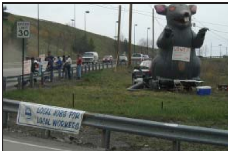
NORTH CENTRAL WEST VIRGINIA Building Trades members stage a "Local Jobs for Local Workers" rally near a Lowes construction site in Morgantown.

The North Central West Virginia Building Trades wants the public in Morgantown to know about it, too. On April 3 and 4 the council organized an