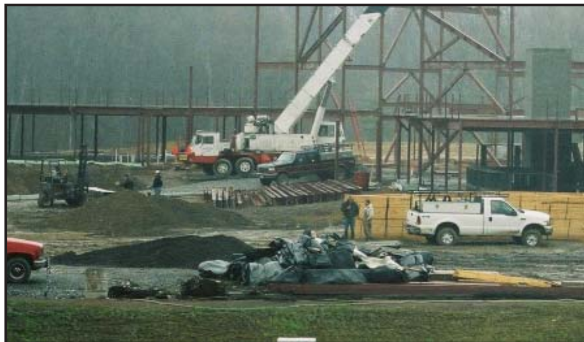
RALEIGH MINE AND INDUSTRIAL SUPPLY performs steel erection at the Beckley Church of God. The company is currently under investigation by the DOL.