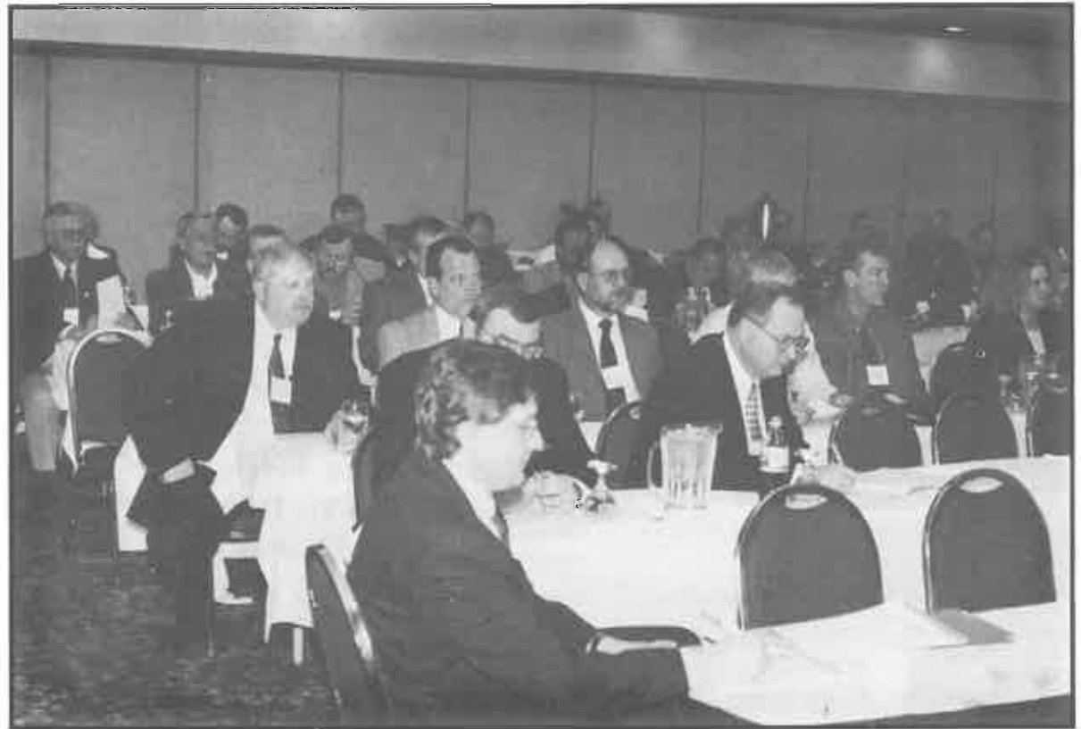
ACT held its Biannual Convention on Feb. 27 where many issues such as salting procedures and the ongoing workers compensation investigation were discussed.