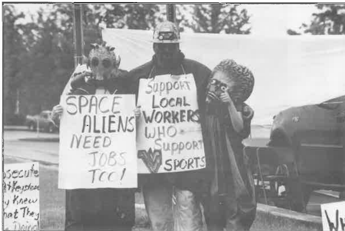
ARE ALIENS INVADING THE COLISEUM? Union members rally at WVU's Coliseum once again to protest USA Remediation's and Keystone Abatement's use of illegal aliens on the asbestos removal project.

This $7.8 million project has been the subject of controversy