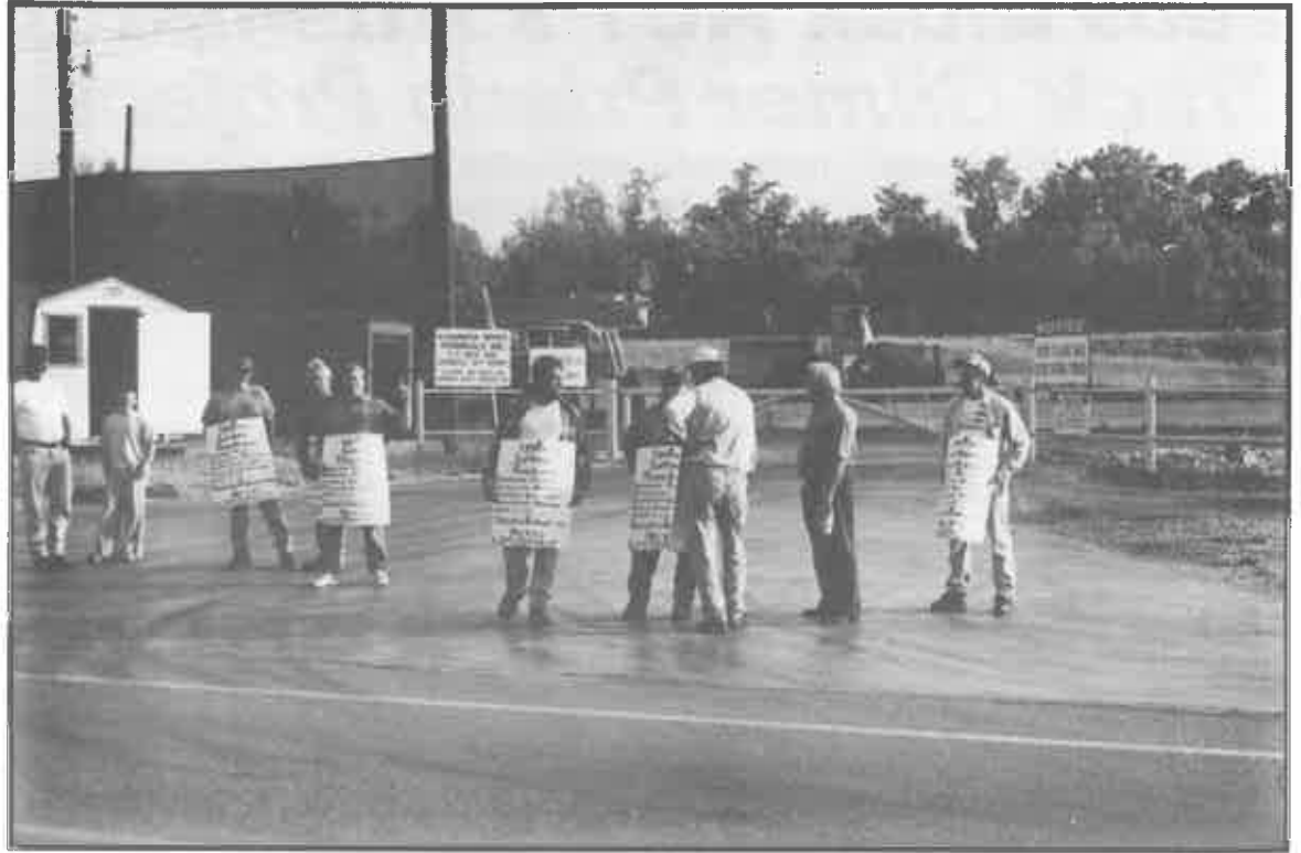
PICKETING AT THE KANAWHA RIVER TERMINALS PROJECT are Tri-State Building and Construction Trades Council members. They are protesting the poor working conditions.

Tri-State Building Trades filed charges with the National Labor Relations Board on behalf of the two organizers on the same day they began the strike.