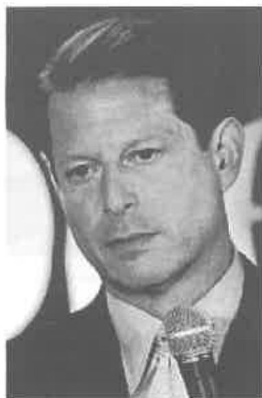
Vice President Al Gore

Bush supports "right-to-work". Bush believes union workers undermine the economy and proudly asserts, "Texas is a right-to-work state with low unionization of the workforce."