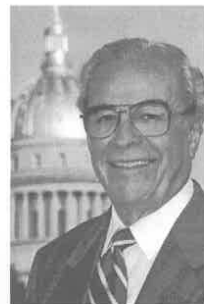
Gov. Cecil Underwood