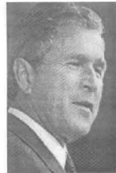
Gov. George W. Bush

"I can tell you why Oklahoma is so poor. You don't have Right-to-Work and you have high workers comp."