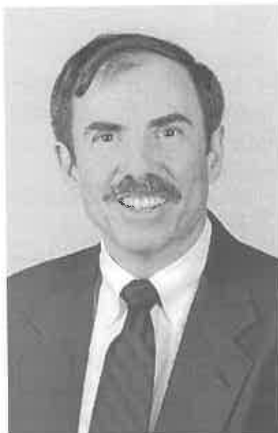
Congressman Bob Wise

"As governor, I will continue to fight for West Virginia's working families. They are the heart of West Virginia. I will protect their way of life and work hard to bring new jobs and prosperity to our state."