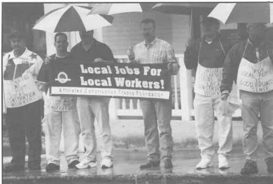
PROTESTING OUTSIDE THE BERKELEY COUNTY COMMISSION offices are members of Laborers Local 679 and members of North Central WV Building Trades.

"This, unfortunately, could not be proven in court."