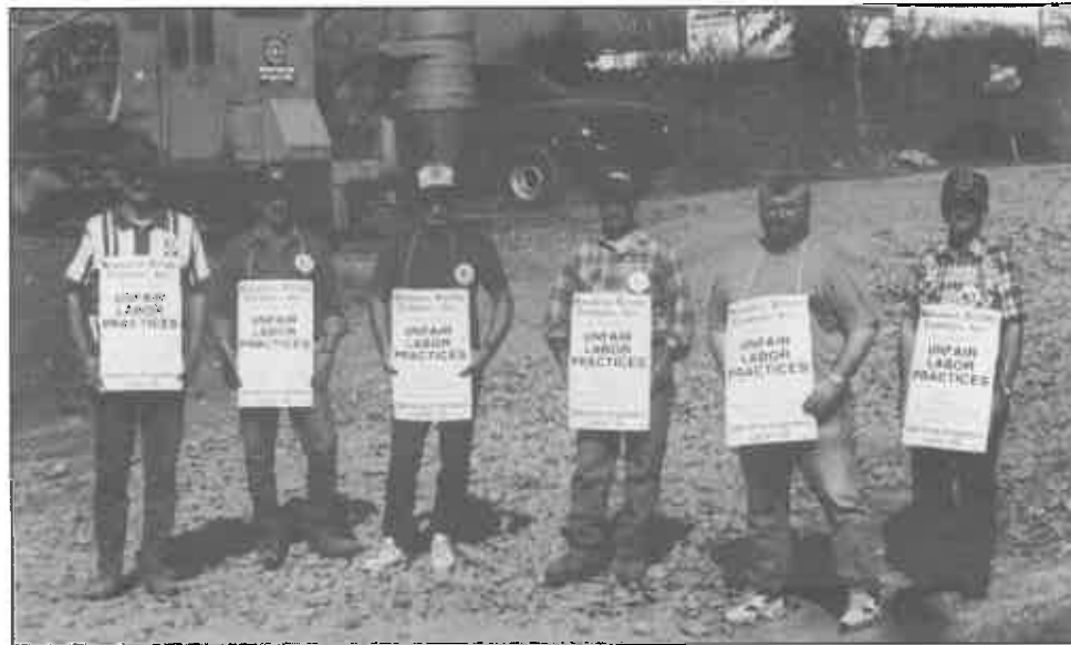
PICKETING AT KSC's Doddridge County Regional Jail Site are members of Operating Engineers Local 132 and Laborers Local 984.

Picketing and hand-billing continued at KSC's Wayne County site, as well as their of-