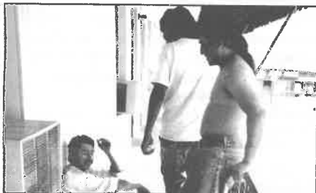
IMPORTING construction workers like these illegal aliens takes a heavy toll on local jobs.

Ask candidates if they will support the West Virginia Jobs Act.