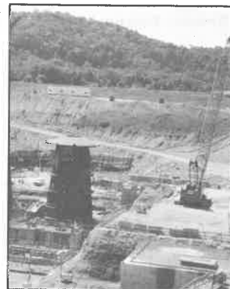
PUBLIC CONSTRUCTION like this Belleville Hydroelectric project improves local living standards.

Ask what candidates will do if faced with a bill to eliminate or weaken the state prevailing wage law.