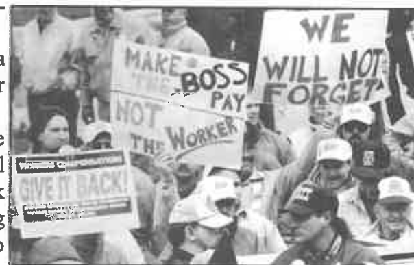
ATTACKS on Workers Comp sparked union protest at the State Capitol last winter.

Ask candidates if they will fix workers comp.