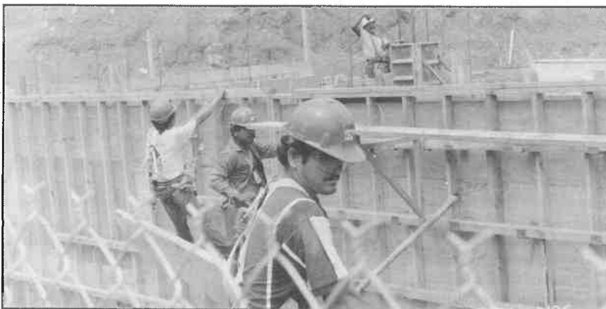
WORKING IN DOWNTOWN CHARLESTON are more than two dozen out-of-state workers brought in by Embassy Suites contractor Dee Shoring Construction Co.

"So we got some union people Continued on page 2