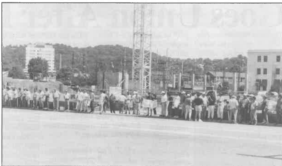
DEMONSTRATING SOLIDARITY are about 75 building trades members in front of the Embassy Suites job site. The group was protesting the importing of out-of-state workers. The same owner and general contractor just finished an Embassy Suites in Seaside, Calif. using 90 percent local workers as required by the city.