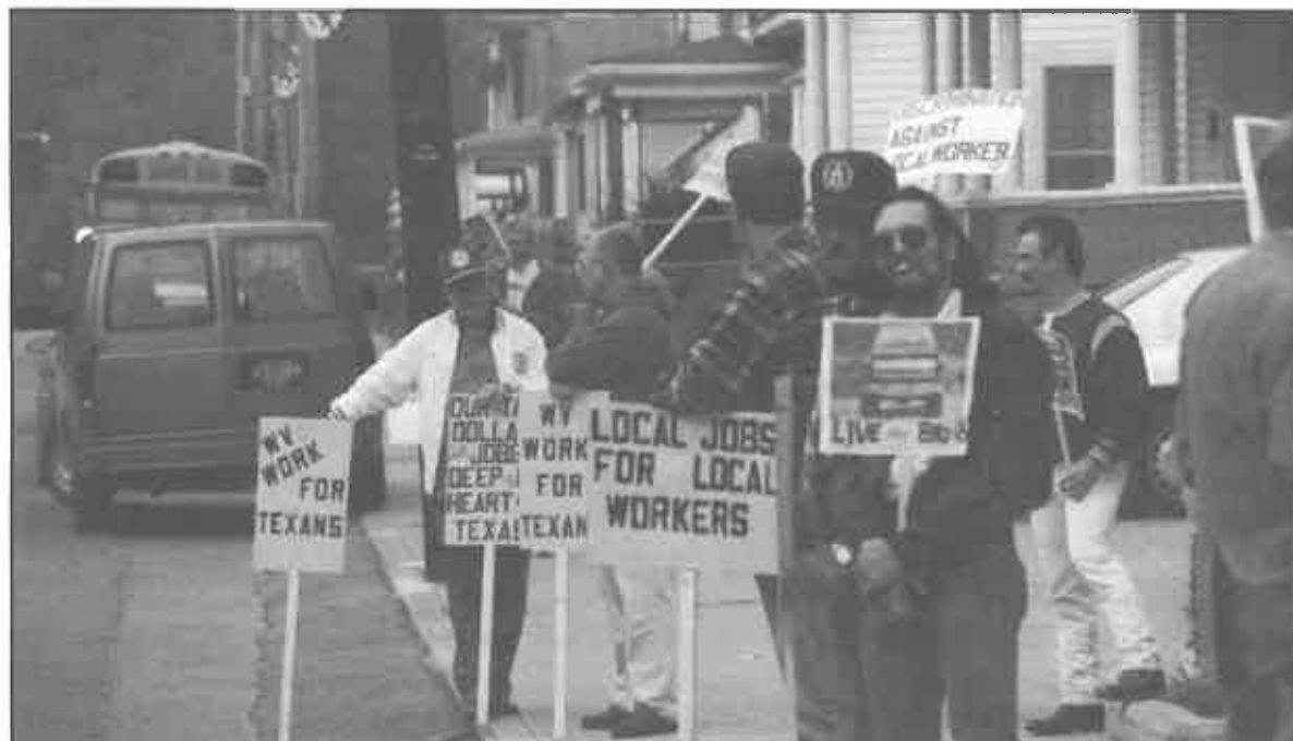
PROTESTING TEXAS WORKERS at the Robert C. Byrd High School in Clarksburg are local union workers in front of the Harrison County Board of Education.