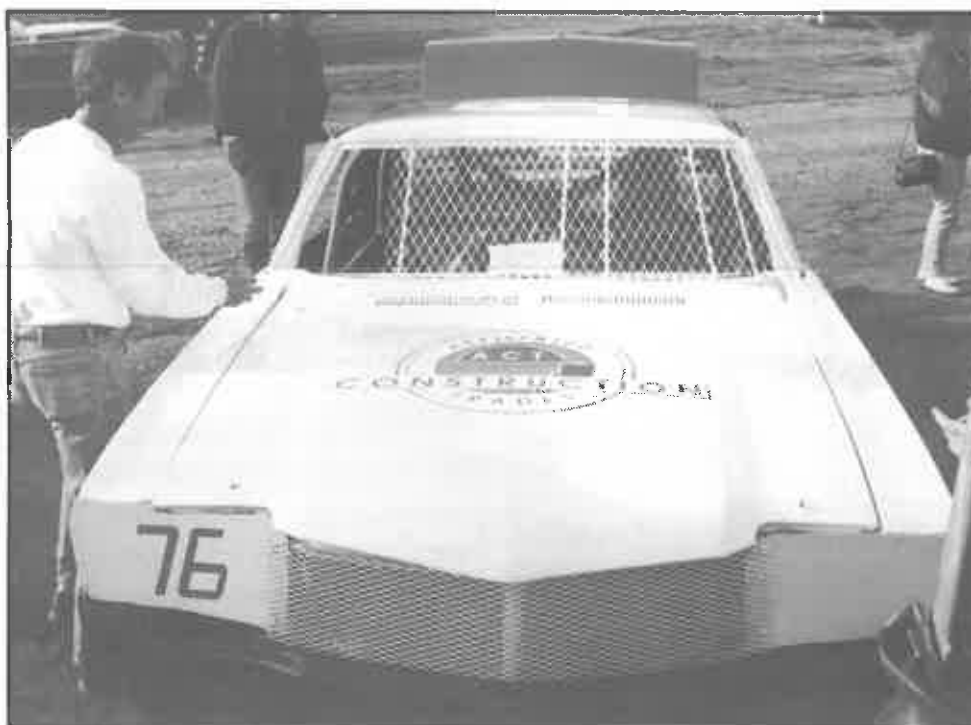
WATCH FOR THE 'ACT CAR' AT WEST VIRGINIA TRACKS.