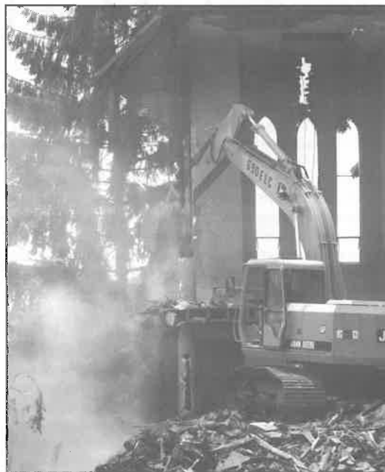
CHURCH DEMOLITION DUST may contain deadly asbestos in this project located on Drummond Avenue in Clarksburg.

Montoney gave the test results to state and federal health officials who are investigating.